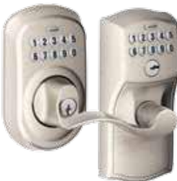
Keypad locks (BE365 & FE595)