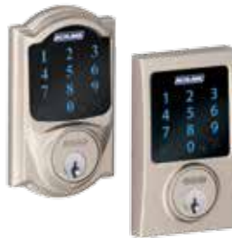
Schlage Connect ™ (BE469)