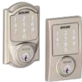
Schlage Sense ™ (BE479)