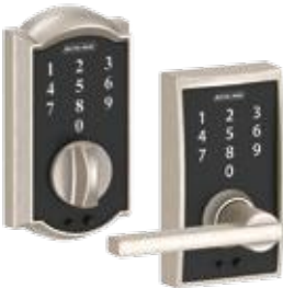
Schlage Touch ™ (BE375 & FE695)