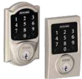
Schlage Connect ™ (BE468)